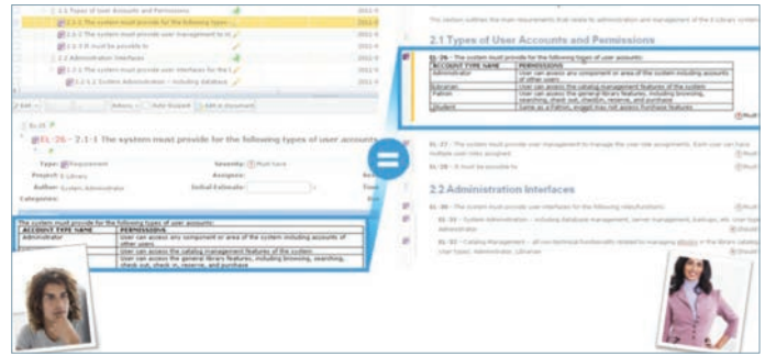
Same data – different views.

Consider, as another example, the benefit of having Live impact analysis. This means having the actual requirements-oriented link navigation needed to find the requirements impacted by a change, promoted in a way to wider navigation in order to find every development artifact and activity impacted by the change. So performing a Live impact analysis operation will enable the user to easily find all the activities that were performed to implement a requirement, their cost, the people involved, all the artifacts to be changed (such as source code and user manuals), plus eventually the impact of the implementation of the change on the project plan deliverables at certain milestones.