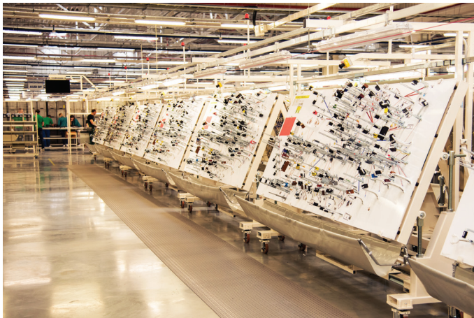
Figure 1: Vehicle electrical systems are becoming immensely complex, containing thousands of components and miles of wiring.

Electrical system complexity is reaching a tipping point across industries, from modern passenger vehicles to sophisticated industrial machines that can now contain nearly 5,000 wiring harnesses. The electrical systems of these machines contain multiple networks, thousands of sensors and actuators, miles of wiring and tens of thousands of discrete components (figure 1). Designing these complex systems is a significant challenge itself, but there also needs to be understanding of how system requirements move into manufacturing and maintenance processes.