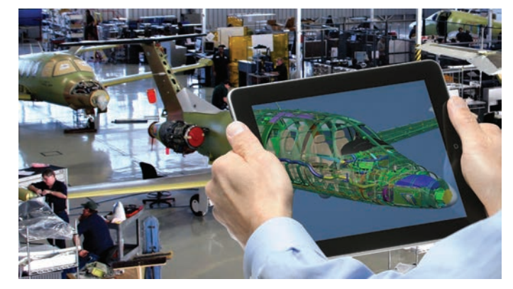
The full value of the digital twin can be realized by its support for product design, manufacturing process planning and production.

Today we can support digital twins for product design, manufacturing process planning and production using the Smart Factory loop and via smart products.