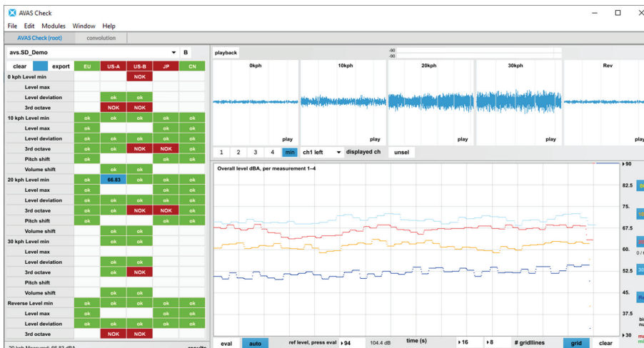
AVAS check front-loads compliance with standards.

A dedicated AVAS check software module is used to evaluate the sound against legal requirements. It supports the major standards in Europe (United Nations Economic Commission for Europe, UN ECE Regulation 138), United States (Federal Motor Vehicle Safety Standards, FMVSS 141) and its derivatives in China and Japan. Together they support sound designs that are not only pleasant and brand-aware, but also comply with legislation from the start. This is accomplished by measuring the transfer function between the AVAS speaker location and the pass-by noise (PBN) microphone and loading that into the Simcenter Testlab Sound Designer software. A matrix with green and red cells indicates if each required check and standard passes the applicable criterion. This is an efficient way to front-load compliance.