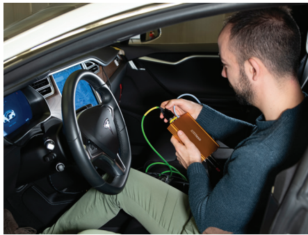
Vehicle unit allows longer term evaluations.