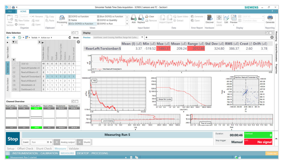
Simcenter Testlab is an integrated, end-to-end solution for RLDA. Using only a single software platform, you have complete control of the full load data acquisition process.