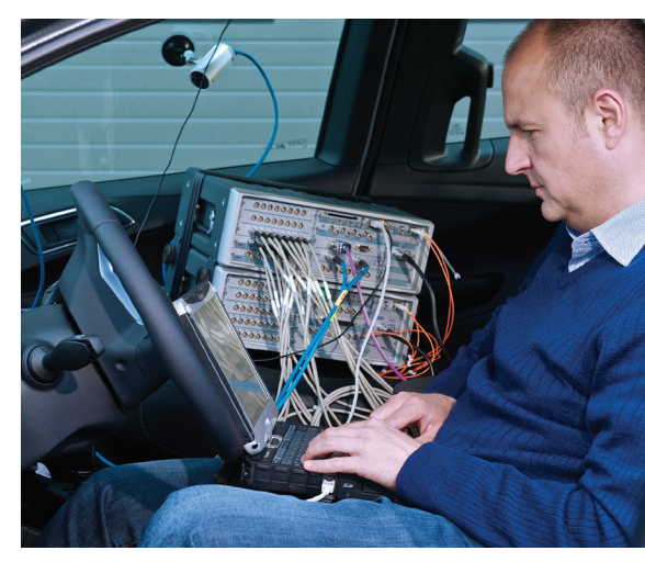
Each Simcenter RLDA solution can be tailored to budget and easily expanded for future testing requirements.

When sharing test results between departments, Simcenter Testlab helps document your data to prevent losing vital information in the process. By consistently organizing and annotating your tests, you can streamline the delivery of the results. Simcenter Testlab lets you manually add key information to raw data, such as operator details, test object descriptions or testing conditions, relating measurement results to product structure. The software automatically annotates all measurements with a complete