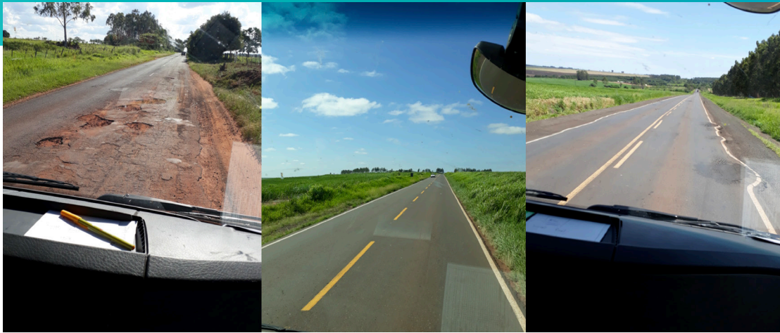
Different road conditions in Brazil effect the durability lifetime of components.

Globally, there has been an upturn in the electrification of both passenger cars and buses, but this is far more difficult to apply to trucks. Heavy trucks often operate in rugged environments and not on the smooth road surfaces of passenger vehicles. The vehicle's batteries are not designed for the extreme shaking that can be found on construction sites or mining operations.