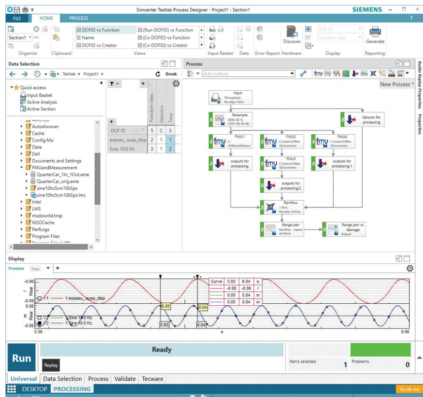
Using FMU methods in a user-defined process in Simcenter Testlab Neo Process Designer.

The FMU method can also be used to embed an observer for calculating virtual sensors. For example, virtual sensors can be created by using model-based observers. In this case, the FMU contains the simulation model and the observer. When it is used on Simcenter Testlab Neo Process Designer, it produces estimates of the missing measurements. These are then stored together with the standard measurement channels.