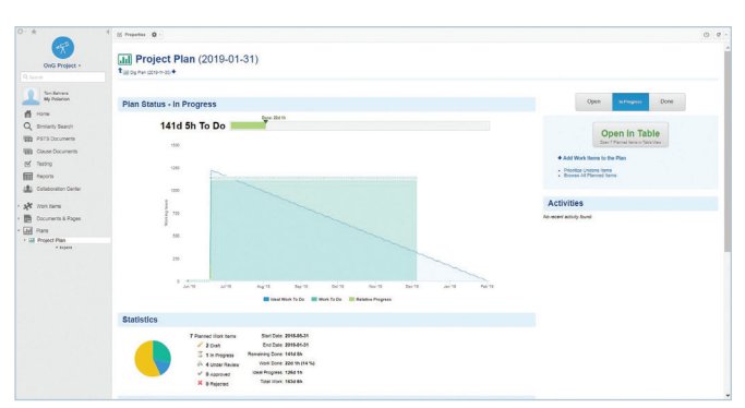
Figure 2: Accurately track project status and dependencies.