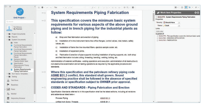
Figure 3: Polarion LiveDoc interface for authoring and editing specifications in a user friendly format that preserves full traceability.

With Polarion, everything is unified on a secure platform using the latest web technologies. You can use a single server or clustered servers (physical and/or virtual) over a regular network or virtual private network (VPN). Start small and scale up easily and affordably. Grow into an enterprise solution that delivers full verification and validation – just add licenses to your installation; there is nothing additional to install or integrate.