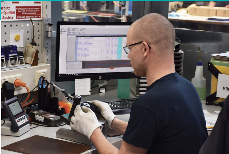
Using QMS Professional software to perform computer-aided quality assurance based on unified data models has greatly reduced the time Miba requires for quality management work.