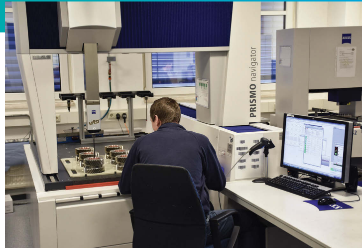
Providing interfaces for popular gauges and coordinate measurement machines, QMS Professional makes it easy to integrate all the inspection equipment required in quality control.

“QMS Professional supports direct and close collaboration between quality managers in different business fields and/or plants to help tear down the sometimes thick walls between their worlds.”