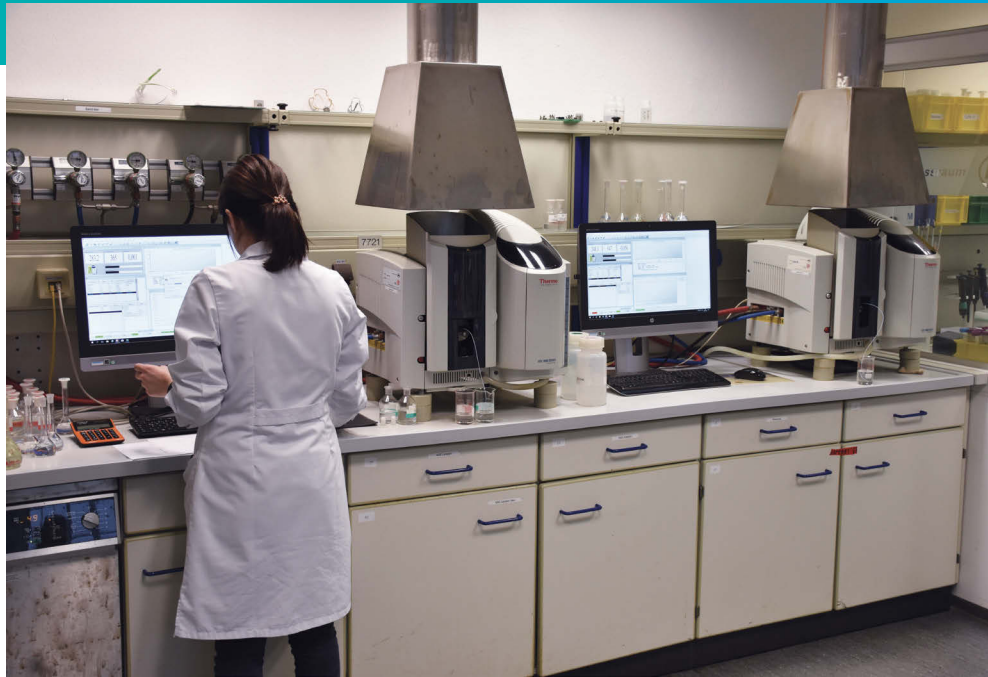
As the surface materials are part of Miba's core competences, the company's QMS Professional software implementation also interfaces to laboratory equipment.