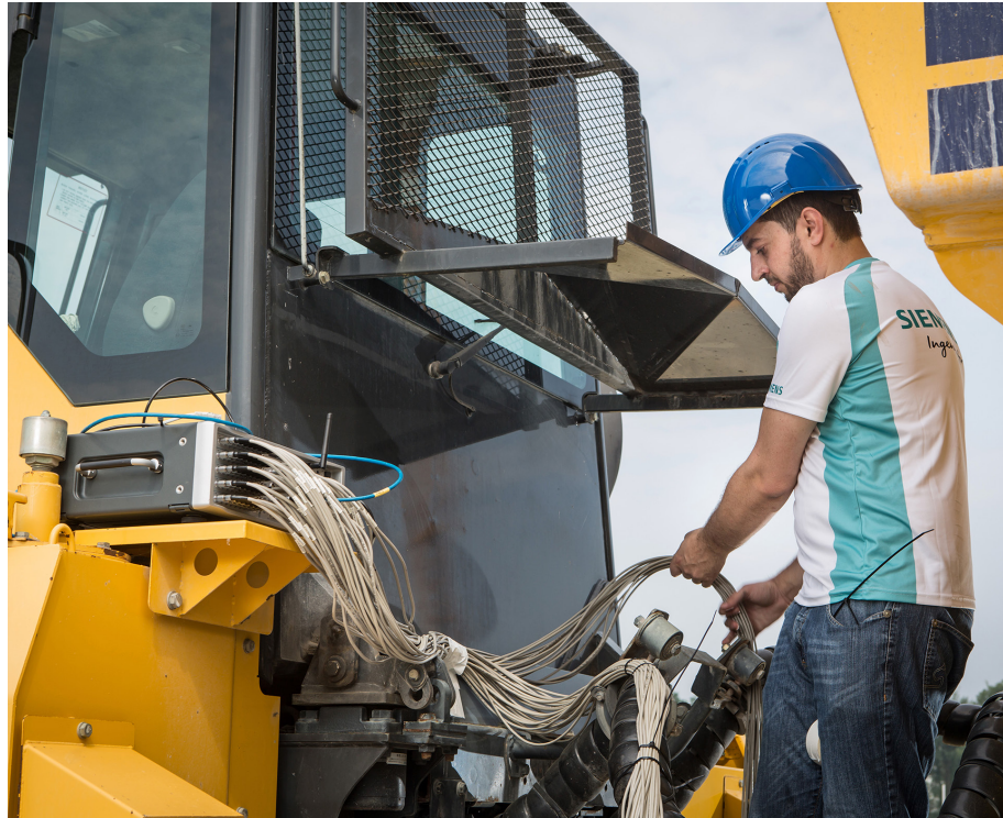
Lengthy cabling is expensive and the fixation of all these cables on the structure in a secure way is very time consuming.

Thanks to its wired and wireless connection options, Simcenter SCADAS RS can easily be connected to company networks. In addition, using modem connections to cellular networks, a Simcenter SCADAS RS system can be accessed when it is at a very remote location over extremely long distance.