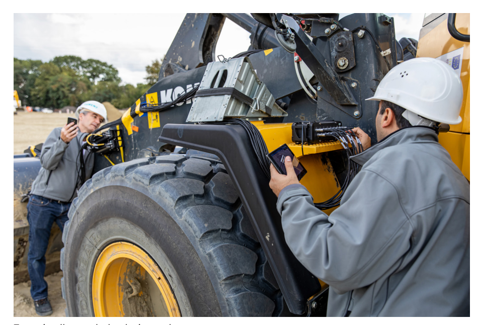
To optimally match the device under test, our scalable and flexible systems support centralized, distributed or combined topologies.

Siemens Digital Industries Software siemens.com/software