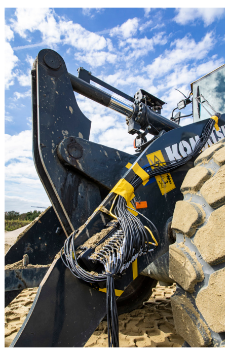
Rugged design for use in harsh environments.