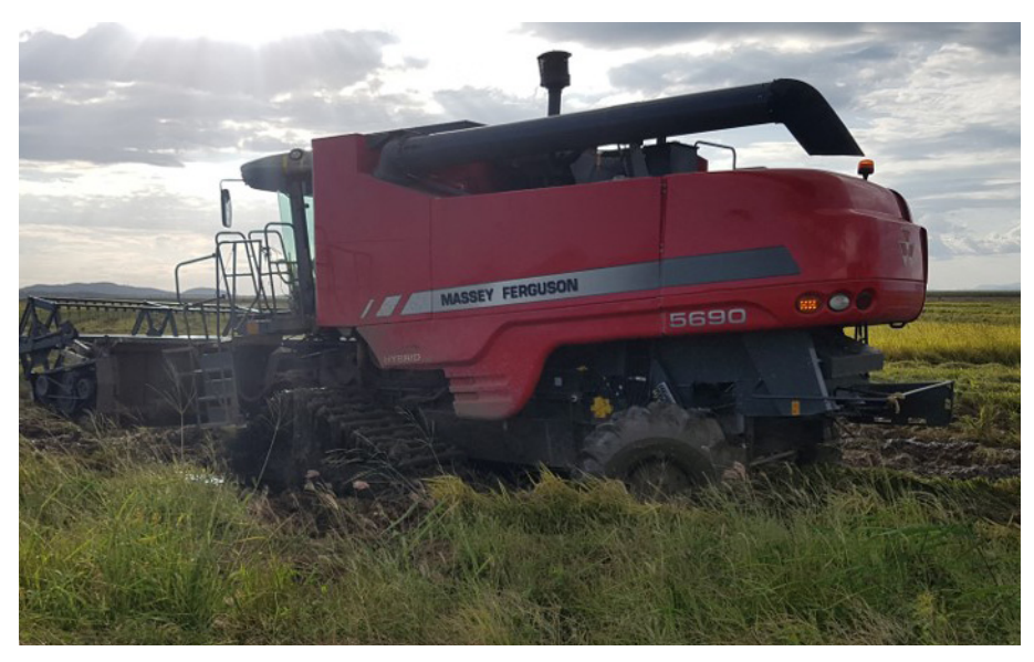
Durability field data acquisition campaigns are typically done under very tough conditions.

Our rugged data acquisition system is also designed for reliable power input to the sensors. It can be configured with an uninterruptible power supply (UPS) unit which provides a stable DC output voltage from unregulated DC power sources. If more power is needed, simply add more UPS units in the daisy chain.