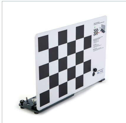
The reference positions the test object and probe into the software environment and holds the probe when not in use.

As long as the camera can track the sphere, you can move the probe around the test object in any orientation or position. The system automatically detects position of the acoustical sensors as well as direction of the intensity vector.