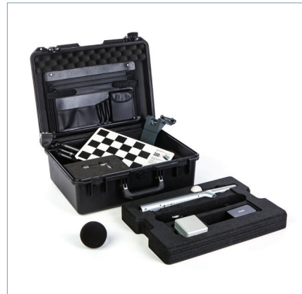
A convenient carrying case safely stores all Simcenter Soundbrush materials for measurements on the go.