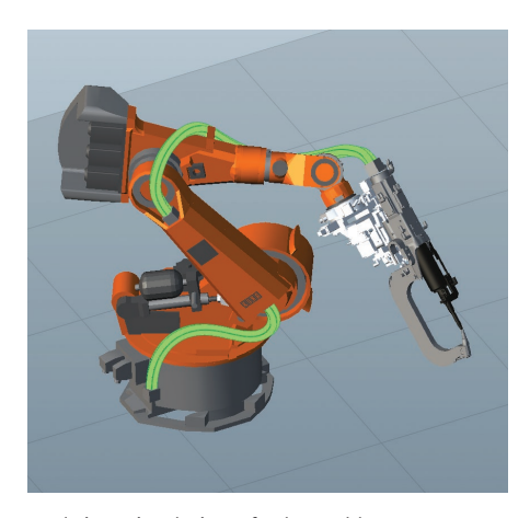
Real-time simulation of robot cables.

Kineo Flexible Cables is a software component that has been carefully designed with OEMs and system integrators in mind. Its portable architecture enables flexible integration with existing software systems. New software