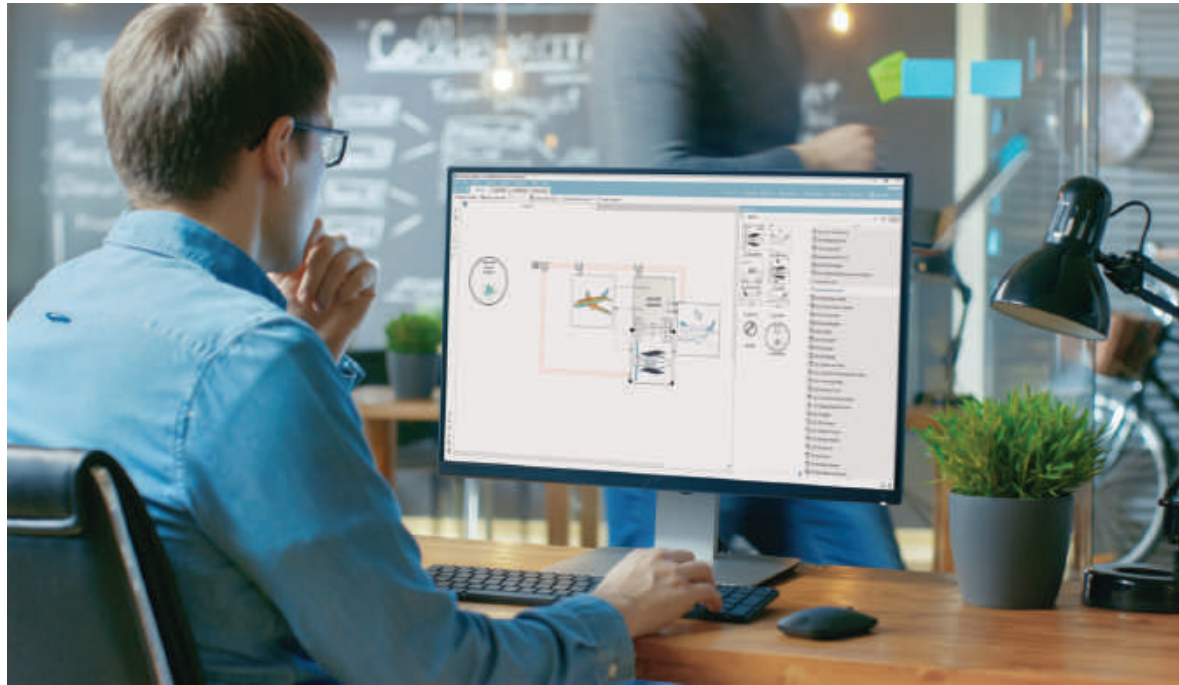
Simcenter Amesim provides a set of off-the-shelf physical libraries that can very easily be extended with a customer's own industrial property.

The issue is how this all works together: the whole does not necessarily equal the sum of its parts. Unlike a complicated system, a complex system is not devisable into a set of isolated subsystems. It is a system or unit itself. And this is the core of the issue. In the quest to make lighter, more economical and greener aircraft, the aircraft system function has become more integrated and interconnected with various onboard software programs that control the aircraft.