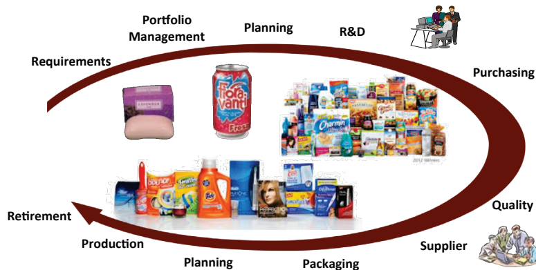
Figure 2—End-To-End Brand Management, from Requirements to Retirement

The bottom line in all of this—the necessity to get it right the first time and build and protect the brand for the long term—requires a holistic, end-to-end approach to brand-related requirements management, as anything less results in sub-optimization, continued inefficiencies, and islands of disconnected automation and information.