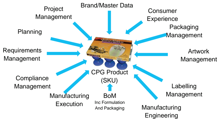
Figure 1—The Breadth of Data that Defines a Product

Senior management within the consumer packaged goods (CPG) and similar industries (e.g., food and beverage) now recognize that maximizing brand value is more complex and more important than ever. In today’s world of specialization, mass customization, outsourcing, and subcontracting, brands are a company’s most critical asset for market differentiation and beating the competition—which ultimately maximize shareholder value. A brand is an intangible collection of features that distinguish a product, but underlying the brand are tangible components that must be defined and managed (Figure 1). These components define what is delivered to the retailer, the consumer, and to the market. They must be understood and managed from an end-to-end perspective, thereby ensuring the brand’s long-term, sustainable market success.