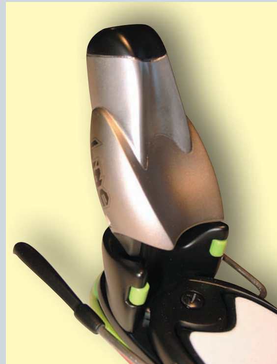
Master Surfacing provides lofting, sweeping and blending capabilities which allow associative feature-based definition of extremely complex geometry.

NX I-deas' Variational Sweep feature takes the "sketch-in-place" concept for planar geometry and extends it to complex free form geometry. V-Sweep lets you sketch a cross