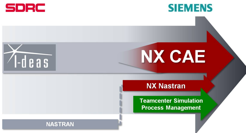
Figure 3—Siemens PLM NX CAE