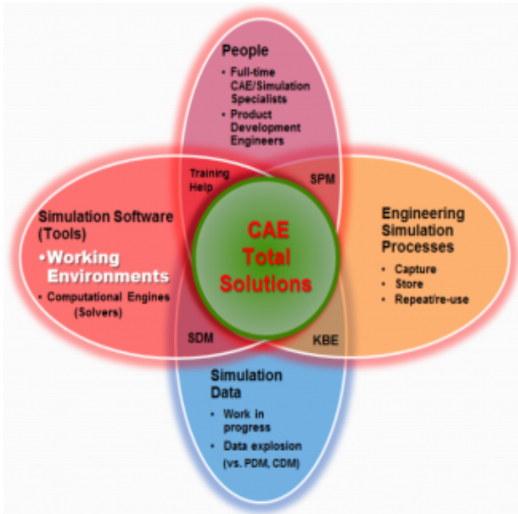
Figure 2—The CAE Total Solutions Pinwheel